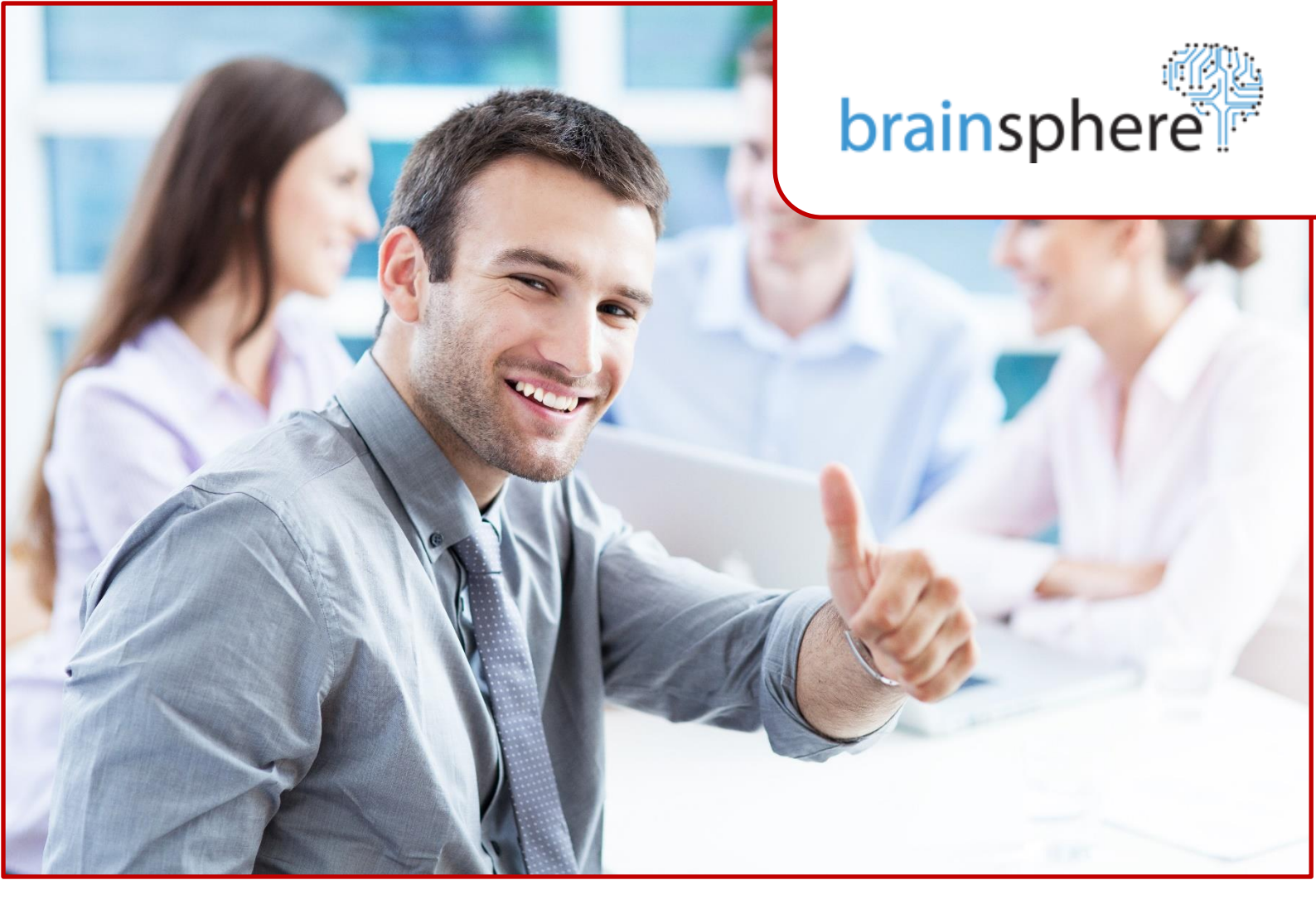
Improve Business Insights & Decision Making with